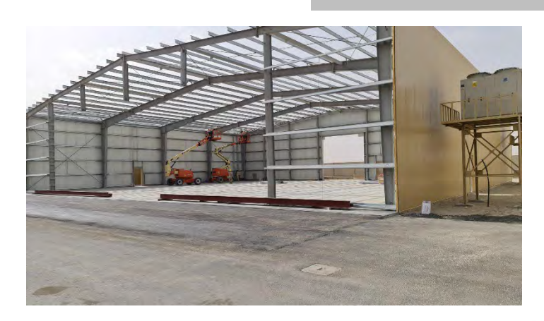
Camp Doha, Kuwait