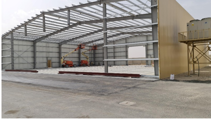
Ali Al Salem Air Base